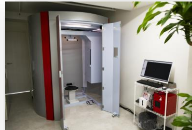
CT scan room