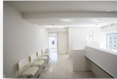
Interior of the clinic

Our clinic, following the sleep clinics in Kyoto, Akita, Shiga, and Miyagi, opened its fifth branch in October 2023. we provide sleep medicine based on extensive experience and expertise.